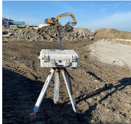
Proposed Air Quality Monitor

The Authority will implement a site-specific air quality/dust monitoring program to document air quality/dust levels at upwind and downwind locations (including the Woodrow Wilson Middle School in Bayonne) and alert authorized personnel in real time of any exceedances. Real-time notifications to authorized personnel will follow a communication protocol approved by the Authority. Contractors must adhere to PM_{2.5} and PM_{10} limits, measured in micrograms per cubic meter ( \mu g/m^3 ). A sample format for reporting air quality (as other) exceedances by location and mitigation is shown in Figure 6 , and a sample map of potential monitoring locations is shown in Figure 7 .