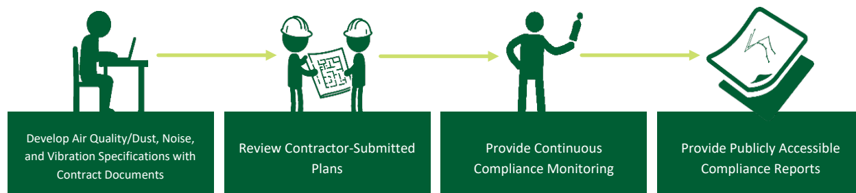
FIGURE 3. AIR, NOISE, AND VIBRATION MANAGEMENT APPROACH

Significant air quality, noise, and vibration impacts are not anticipated as part of Project construction. The monitoring areas with the potential to be impacted by construction-related activities are shown in Figures 4 and 5 . These two figures provide a general overview of the NB-HCE Project alignment, relative to adjacent communities. In an effort to reassure community residents proximate to construction activities, the Authority is developing a comprehensive air, noise, and vibration monitoring and reporting program to be initiated with pre-construction surveys to establish baseline conditions. Prior to receipt of more detailed construction information and input from adjacent communities, the general monitoring area is shaded in purple. This area is subject to modification as the construction means and methods, duration, and specific activities are finalized.