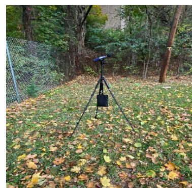
Proposed Noise Monitor

Prior to construction, the Authority will perform pre-construction background noise measurements to determine existing noise levels within the community. Measurements will be documented continuously (24/7) over a period of several weeks. Background noise measurements will be documented in both Jersey City and Bayonne. There are no noise-sensitive sites near the work areas in Newark. Noise measurement locations will be selected and approved by the Authority.