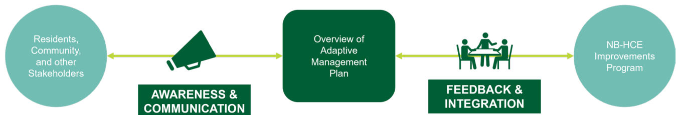
FIGURE 1. NB-HCE IMPROVEMENTS PROGRAM OUTREACH APPROACH

These measures are focused on continued community outreach during construction and an air, noise, and vibration monitoring program. The AMP provisions are in addition to permit-specific mitigation that is outlined in the Commitment Summary, detailed in the NB-HCE Environmental Assessment Executive Summary. The monitoring and mitigation measures outlined in this AMP are developed to avoid or lessen potential environmental impacts. The addition of an AMP to an EA supports the recommendation for a Mitigated FONSI.