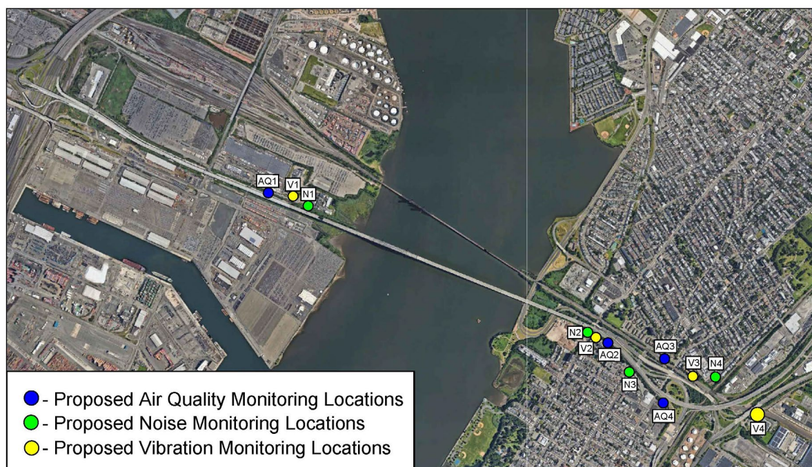
FIGURE 7. SAMPLE MAP OF POTENTIAL MONITORING LOCATIONS