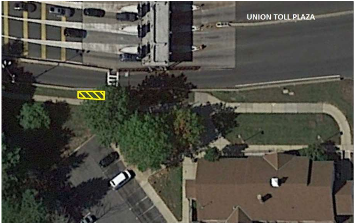
Union Toll Plaza