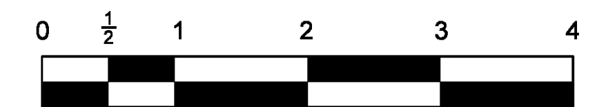
ORIGINAL SIZE IN INCHES

BORDER: 2" LEGEND AND BORDER: WHITE BACKGROUND: GREEN E(NJTA)6-2 Series